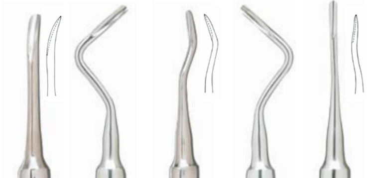
DEL3 DEL302 DEL302HF DEL303 DEL303HF