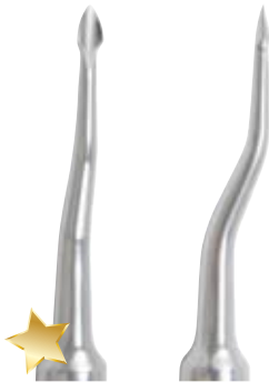
DEL2SPD DEL2SPD side