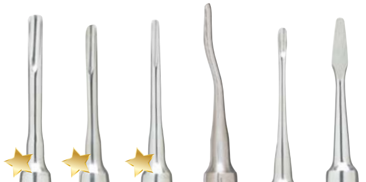
DEL34 DEL34S DEL46 DEL77R DEL81 DELA