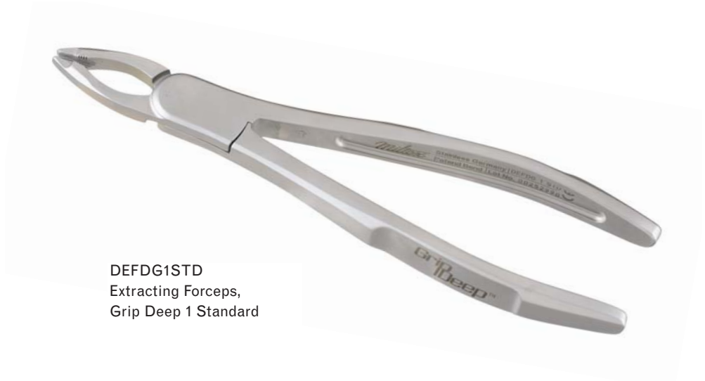
DEFDG1STD Extracting Forceps, Grip Deep 1 Standard

Grip Deep™ extracting forceps have been designed to allow subgingival access to the root while removing a tooth. The beaks are tapered, which allows them to penetrate deeper into the tooth socket and maximize the tooth-to-forceps contact. The beaks are also serrated which allows for better gripping of the tooth surface. This helps aid in atraumatic removal of the tooth and reduces the risk of fracturing the root structure, or cause trauma to the surrounding hard and soft tissues. The risk of crown fractures is also reduced.