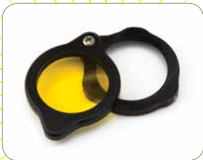
REF 15061 Flip-Up Dental Composite Filter