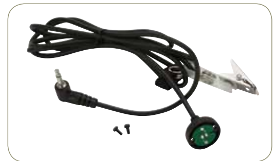
REF 15056 Replaceable Cable