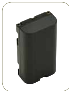
REF 15057 Ion Battery