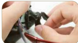
2. Remove nose piece from frame