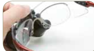
3. Place insert behind frame shield; the insert snaps into pegs