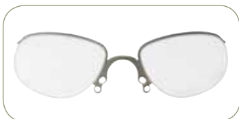
1. Bring insert to your Optometrist for personalized prescription