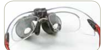
4. Place nose piece back onto frame