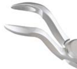
DEFDG210S Grip Deep 210S