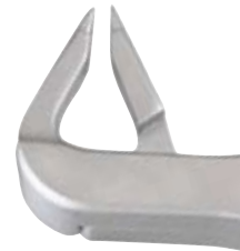
DEFDGM4 Grip Deep MD4