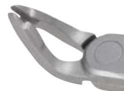
DEFDG151 Grip Deep 151