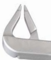
DEFDGM3 Grip Deep MD3