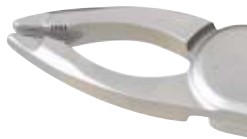
DEFDG1STD Grip Deep 1 Standard