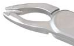
DEFDG150A Grip Deep 150A