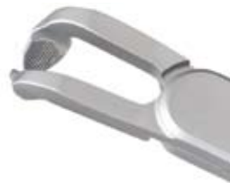
DEFDG222 Grip Deep 222