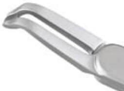
DEFDG845 Grip Deep 845 No serrations