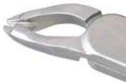
DEFDG150* Grip Deep 150 * Most popular pattern