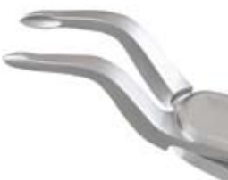
DEFDG65 Grip Deep 65 No serrations