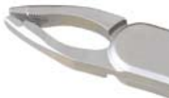
DEFDG99C Grip Deep 99C